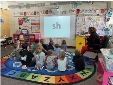
Grade 2B - UFLI (An Explicit and Systematic Phonics Program)

2B has been working hard on UFLI lessons! For those of you who are not familiar with UFLI, it is a phonics-based program that our school is following this year. We love building words with our magnet letters! Thank you to our parent volunteers who prepared all the materials for this program.